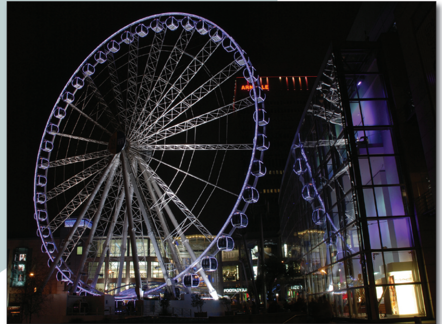
The Manchester Wheel is similar to the London Eye but smaller and transportable, and as such is temporary. It offers tourists and shoppers a unique view across the roof tops.