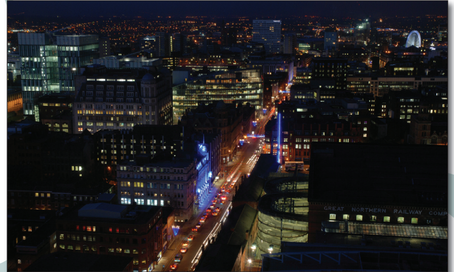
Deansgate is Manchester's longest street and runs rigidly straight north-south. This view is taken from the 23 rd floor of the North West's tallest building, Beetham Tower.