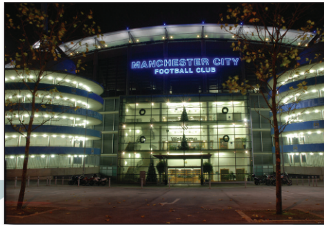
The home of Manchester City.