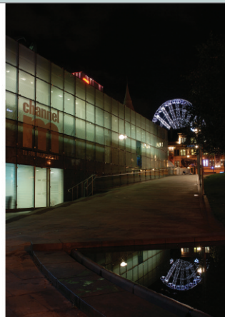
It also provides a home for Manchester's own TV channel - Channel M.