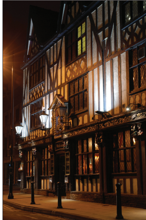
Just off Piccadilly and Market Street is 'The Shakespeare' public house. This has a fascinating history as in the 1920s the complete pub was moved from Chester where it had been known as the 'Shambles'.