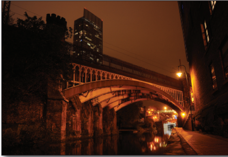
The skewed bridge that carries the railway across the Rochdale Canal is just one of many elegant Victorian feats of engineering that have stood the test of time in this area.